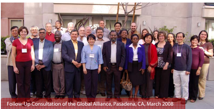
Follow-Up Consultation of the Global Alliance, Pasadena, CA, March 2008

A meeting of the GA Steering Committee is being planned for the week of March 8-11 next year in Bangalore. More information and official invitations will be sent to the steering committee and resource persons before the end of Oct 2009.