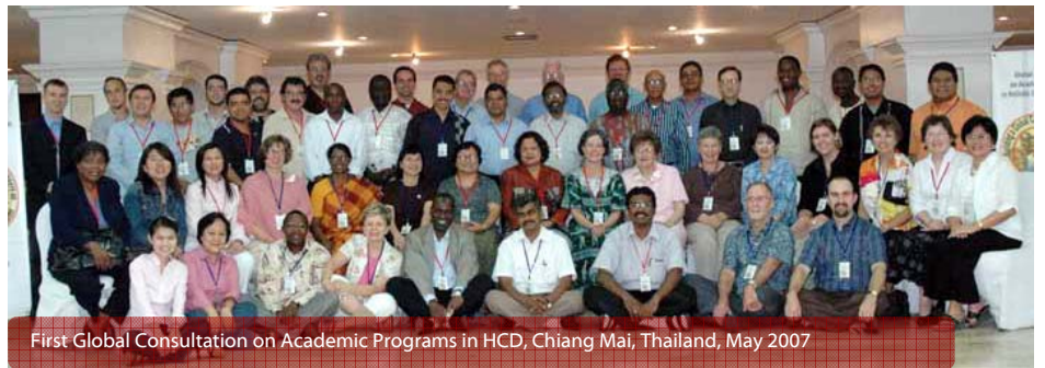
First Global Consultation on Academic Programs in HCD, Chiang Mai, Thailand, May 2007

In Sept 2008, the first regional meeting took place in Quito, Ecuador. Hosted by South American Seminary (SEMISUD), the meeting was attended by over 20 seminary leaders from Latin America and the Caribbean. One key outcome was the formation of the Regional Alliance for Comprehensive Child and Teenager Development to support efforts towards realizing the vision in the region.