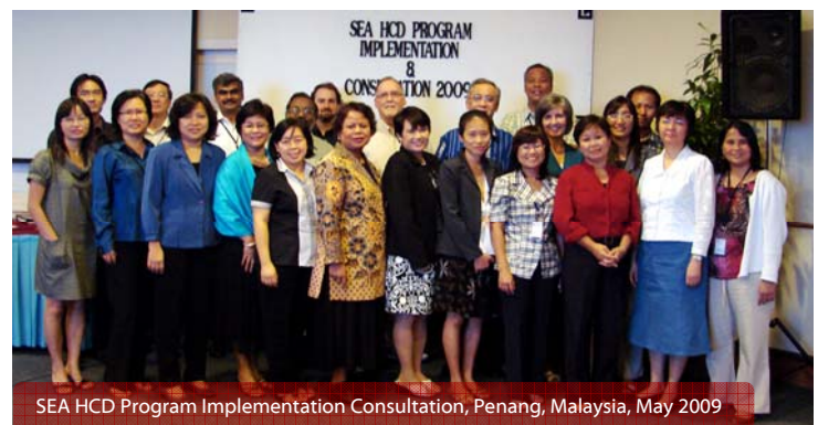
SEA HCD Program Implementation Consultation, Penang, Malaysia, May 2009